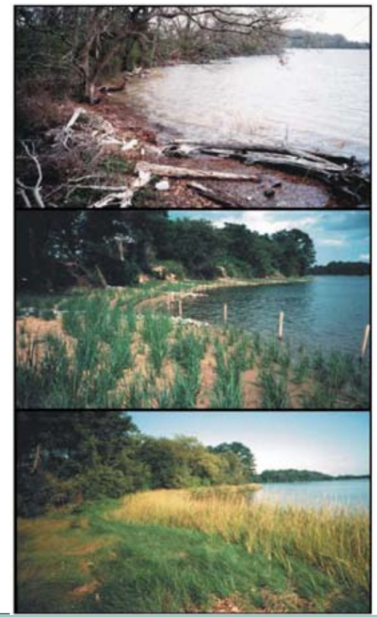
Planting vegetation offers an alternative for reducing erosion at some sites. Top photo shows a pre-project shoreline on Wye Island in Queen Anne's County, Maryland. Marsh grass was planted on sand fill and short, stone groins were placed. Middle photo is three months after installation. Bottom photo is six years after installation.

Cumulative impacts refer to the combined effects on legal, social, ecological, and physical systems. From a legal or regulatory standpoint, issuing permits may set a precedent, potentially facilitating the approval process for future requests for similarly situated structures. From an ecological standpoint, the cumulative impact of the loss of many small parcels will at some point alter the properties, composition,