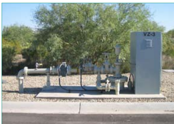
A reclaimed water recharge well in Phoenix, AZ.

Several strategies have been proposed to address the need for sustainable water solutions by reducing water use, increasing water supplies, and reusing treated wastewater. In addition to such strategies, however, there will likely always be a need for temporarily storing water during times of abundance for later release during times of need. Historically, dams and reservoirs have been used for this purpose. But a number of factors—including high evaporation rates, environmental costs, and the decreasing availability of land for dam construction—have increasingly made building additional dams impractical. These