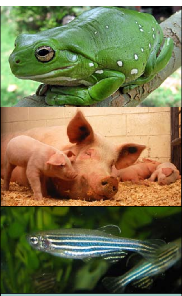
Those who care for and use laboratory animals are responsible for minimizing animal pain whenever possible. The report describes ways to recognize pain in nonhuman primates, dogs, cats, laboratory rodents, rabbits, farm animals, birds, reptiles, fish, and amphibians.

Humane endpoints define when a study should end or the study design be changed due to animal pain, distress, and welfare considerations. Adopting humane endpoints is necessary for the sake of ani-