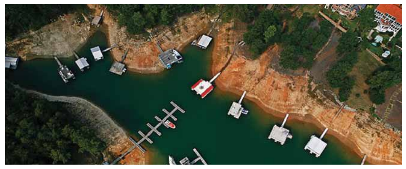
FIGURE 3. LOW FLOW HYDROLOGY: GEORGIA'S LAKE LANIER RESERVOIR, FALL 2007. With water supplies rapidly shrinking during a drought of historic proportions in fall 2007, Governor Sonny Perdue declared a state of emergency for the northern third of the state of Georgia. Georgia officials warned that Lake Lanier, a 38,000acre reservoir that supplies more than 3 million residents with water, was less than three months from depletion.

There has been a fundamental shift in how society values natural processes and manages landscapes. Wetlands, once considered low quality land in need of drainage, are now recognized as critical for a range of ecosystem services from flood control to providing habitat. Rivers were once viewed mainly as large scale canals and were blocked from migration, cut off from floodplains, and depleted of sediment and water. Now efforts are underway to restore natural processes to rivers to regain aquatic ecosystem function and flood management. Scientists currently lack sufficient understanding from field studies and quantitative models to make reliable predictions about desired outcomes of various restoration projects.