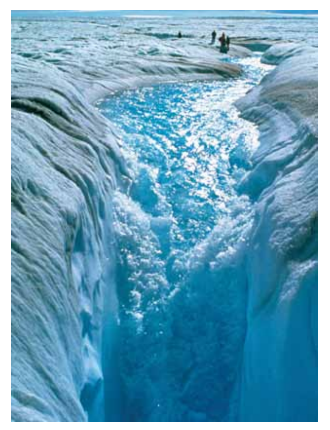
FIGURE 2. FLOWING MELTWATER ON THE SURFACE OF THE GREENLAND ICE SHEET, THE IMPACT OF CLIMATE CHANGE ON HYDROLOGIC PROCESSES.

There is likely more life below the Earth's surface than above it. The diversity of subsurface life is staggering; just a few grams of soil could contain thousands of species, and life extends far into the weathered rock zone and even into bedrock. Subsurface ecosystems form their own environments, many challenges exist in probing how these ecosystems create and direct hydrologic pathways, release gases to the atmosphere, and control access to moisture and nutrients to aboveground ecosystems.