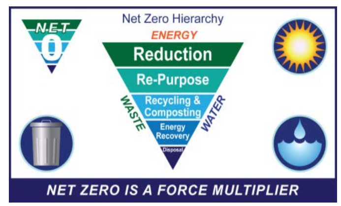
Figure 1 . Net Zero Hierarchy.

surface water resources of that region in quantity or quality. A Net Zero Waste installation is one that reduces, reuses, and recovers waste streams and converts them to resource values with zero solid waste to landfills.