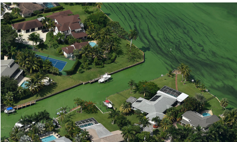
FIGURE 2. Algal bloom in the St. Lucie River Estuary in June 2016.