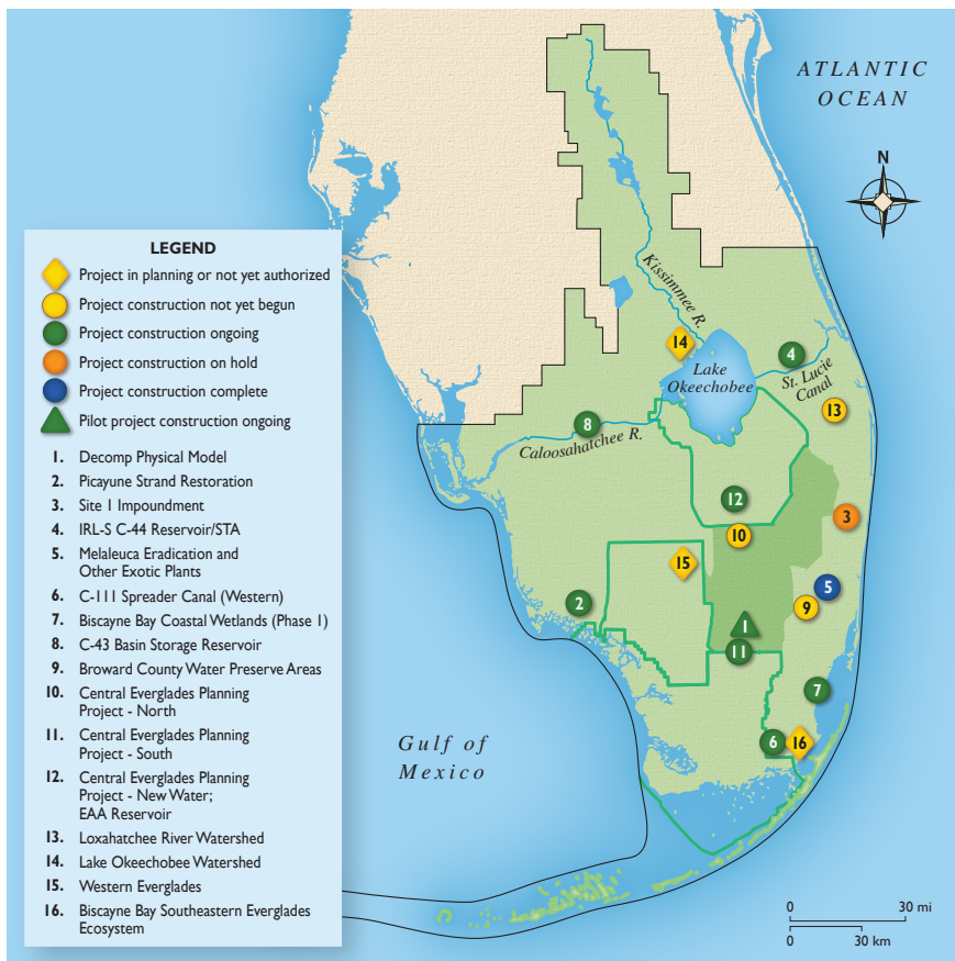
FIGURE 1. Locations and status of CERP projects.