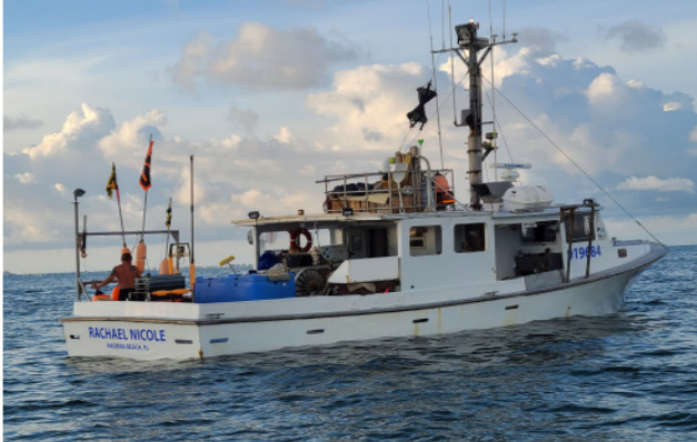
Regional fishery management councils and NMFS must consider the impacts of LAPPs and other measures to prevent overfishing on both commercial and recreational marine fishing interests. A commercial reef fish longliner at Madeira Beach, FL.

The review of the golden tilefish program found that, since program implementation, overcapacity was reduced, derby-style fishing subsided, and wholesale prices improved, generally meeting the program goals. The 2019 wreckfish review found relative success in achieving its objectives; however, given the very small number of vessels and people involved, NMFS's rules on confidentiality limited the data available to assess economic and social objectives.