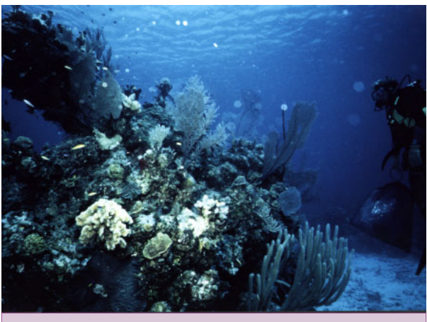
Many marine plants and animals produce chemicals to protect themselves from enemies. Some of these chemicals have potential as pharmaceuticals.

The ocean became a major focus of natural drug discovery because it is somewhat unexplored in relation to drugs found from terrestrial sources. The ocean contains more than 200,000 species, which is only a small fraction of all of the species that are yet to be discovered. Because many marine species live in crowded habitats, cannot move from their environment, and have very basic immune systems,