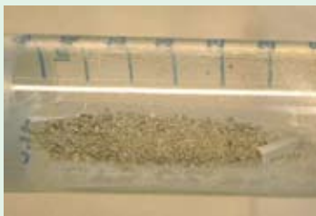
B. anthracis spores, taken from the letter sent to the New York Post and postmarked September 18, 2001, are prepared for analysis.

As many as two dozen nations have engaged in bioweapons research. All the major combatants in World War II had bioweapons research programs. Only Japan actually used a biological weapon, in the Sino-Japanese war that extended into World War II, by air-dropping plague-infested fleas in parts of China to create epidemics. The United States established an offensive bioweapons program during World War II to deter the use of bioweapons and to retaliate against an attack if necessary. Because bioweapons, if used, could spread to military and civilians alike and affect both enemies and allies, President Richard Nixon shut down the United States' offensive bioweapons program in 1969. Bioweapons stockpiles were destroyed and facilities were converted to other purposes, including research on defenses.